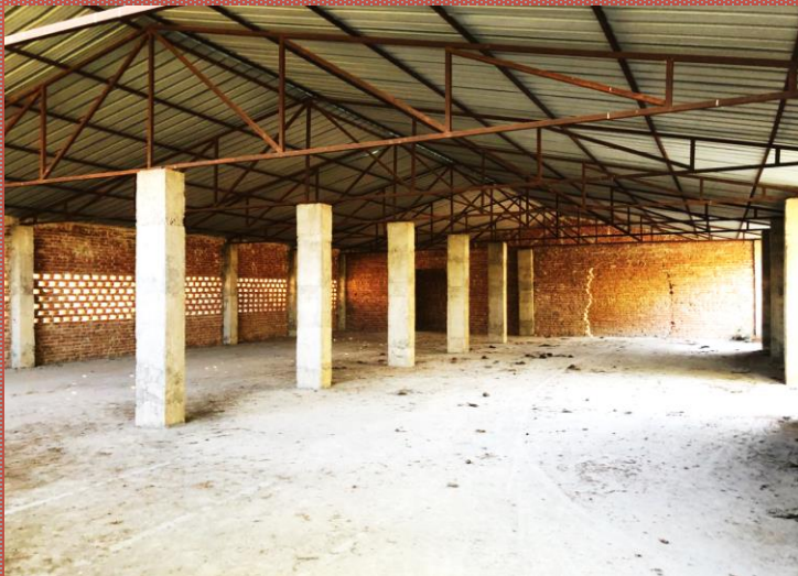
View of Cow Ranch