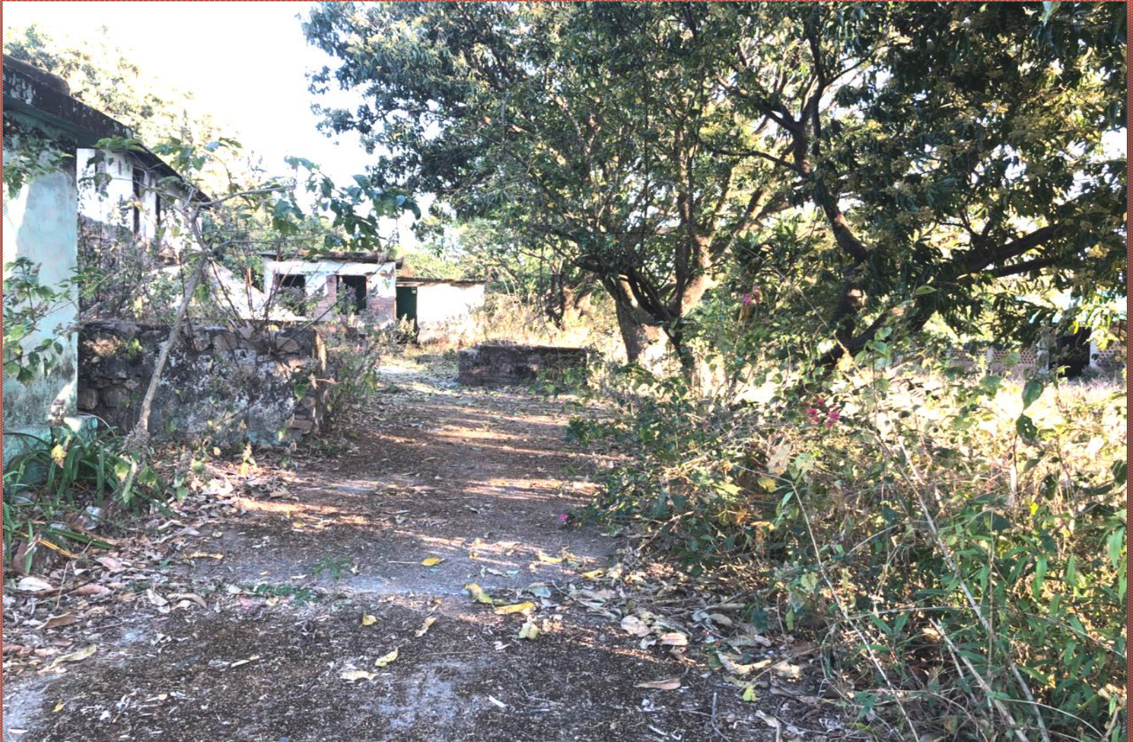
View of link road