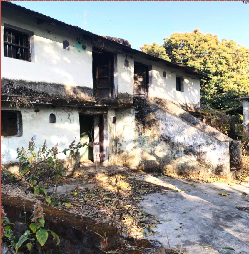
Close view of the old house