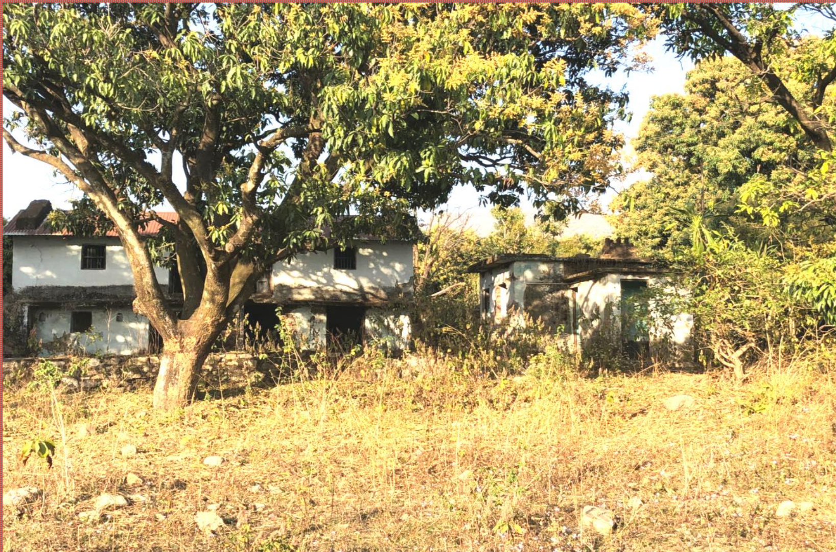
The old House